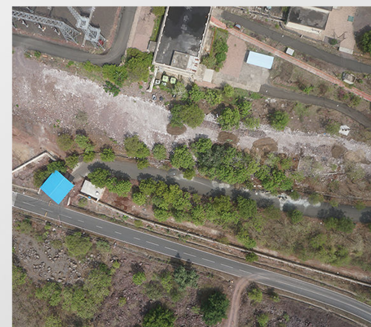
High Resolution RGB Camera