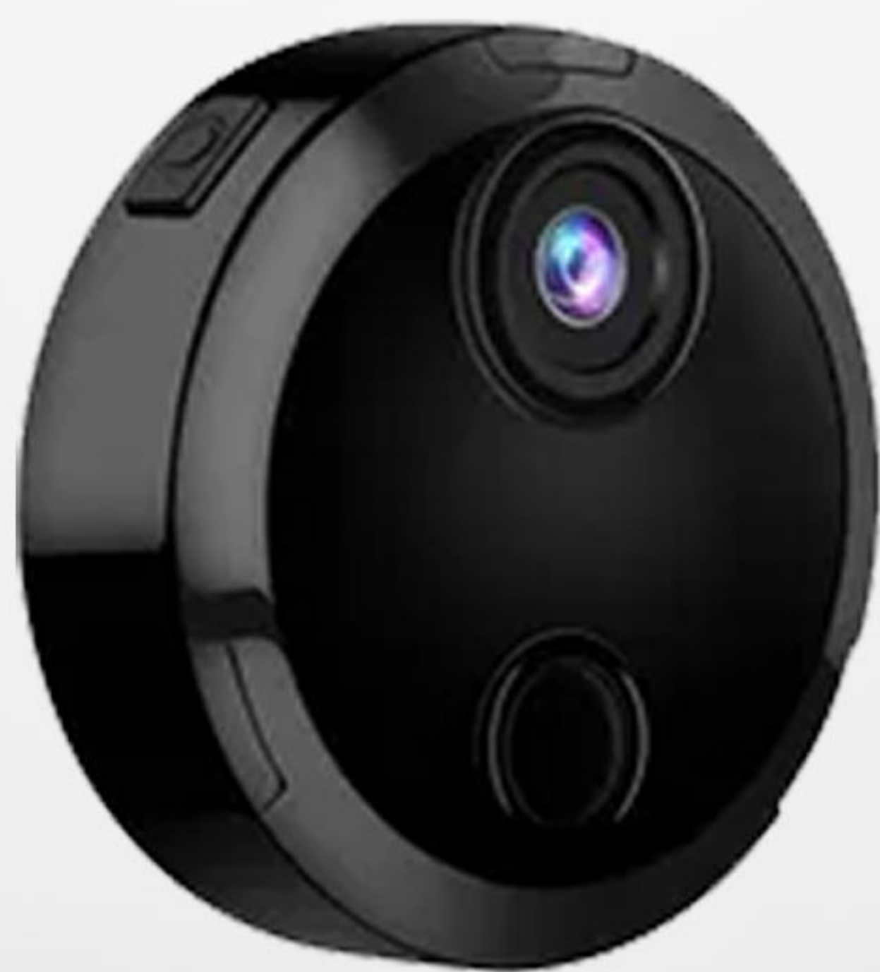
4K Camera with EIS